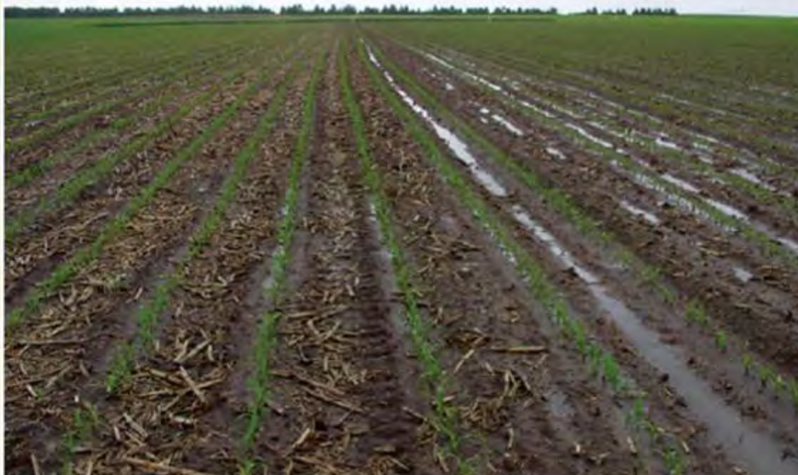
Water infiltration in Strip-tillage (ST) and Conventional-tillage (CT)